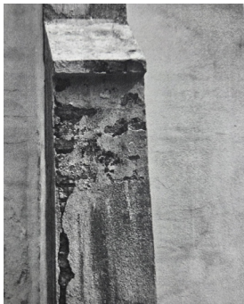
Exposed brick visible due to deteriorating stucco